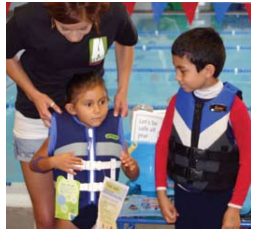
Life Jacket Boot Camp is one of our many educational outreach projects that teaches parents and kids how to be safe around all bodies of water.

On the webpage, you can access or print a two-page handout featuring safety tips for water, sun exposure, playground,